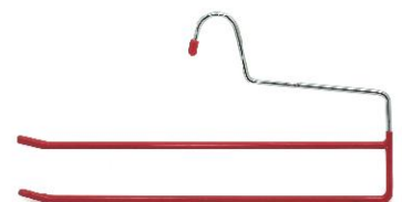
2 in one pants